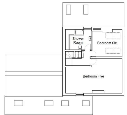
LOFT FLOOR PLAN

NOT TO SCALE. FOR ILLUSTRATIVE PURPOSES ONLY